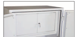
Optional Coffers** (FS1512/13/14 only)